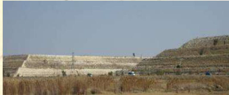
tailings Dams in the southeast of Welkom (geotec, 05/2011)