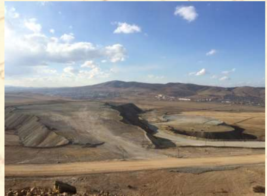
Mine heap in the proximity to Erdenet