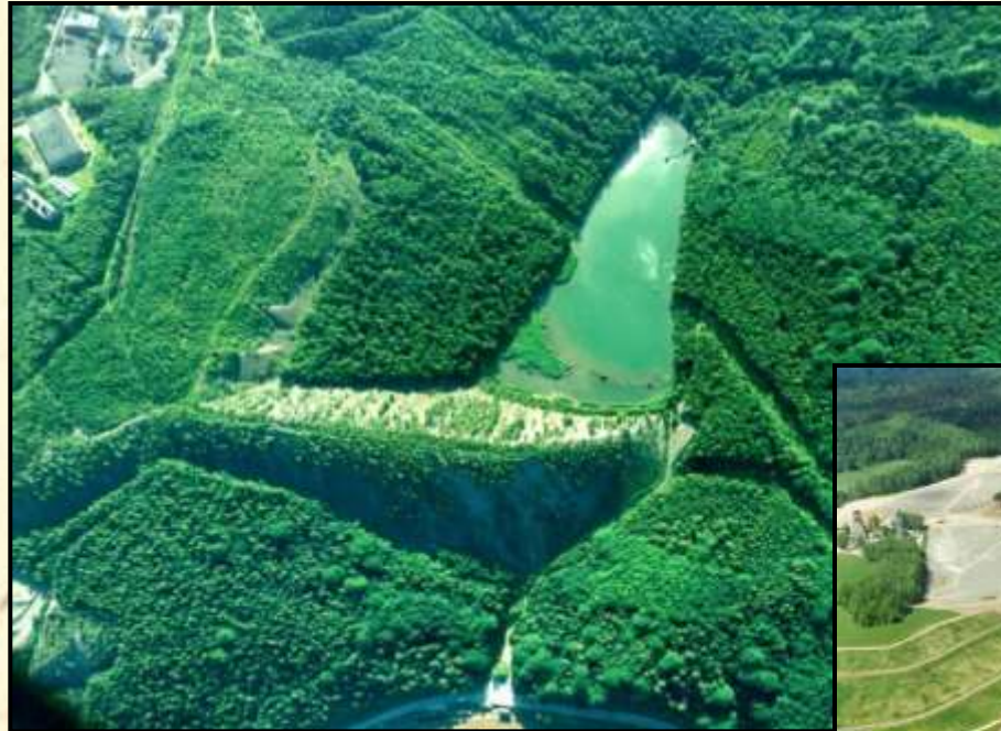
Situation in 1992