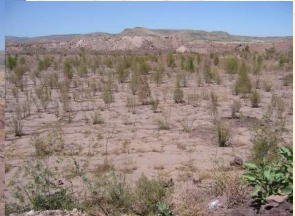
starting new vegetation, 5 years old

Open-cast, in the background the mine worker village